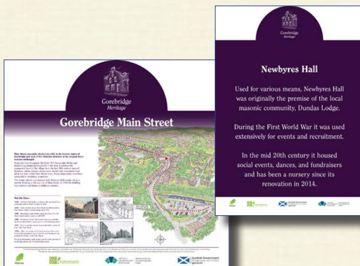
Typical Heritage Trail panel and plaque