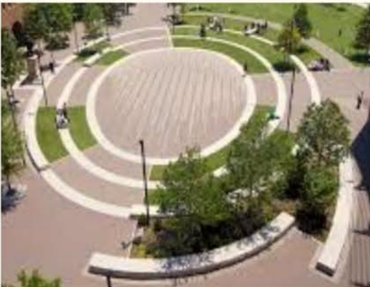
Tree lined terraced plaza with heritage style street furniture and lighting