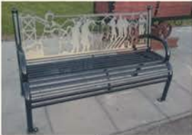
Miners Bench Seats