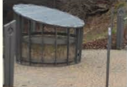
Nodal point/space for mining feature