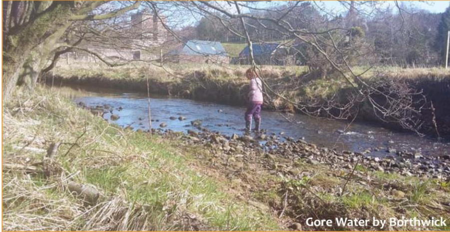
Gore Water by Borthwick