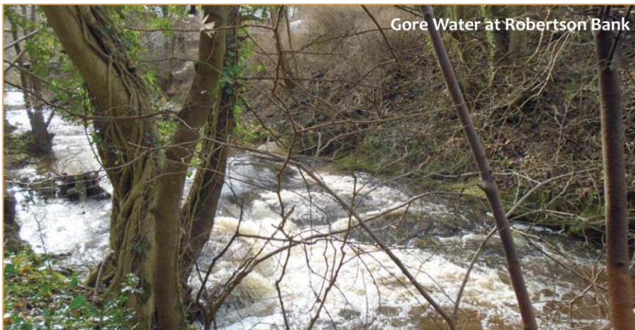
Gore Water at Robertson Bank

This circular walk takes you through fields and by the Gore Water so it can be very muddy at times. There are also some fences to climb along the way. The way back from Borthwick is on metalled roads, quiet country lanes with little traffic and no pavements so care is required. The route takes you up to the entrance to Borthwick Castle.