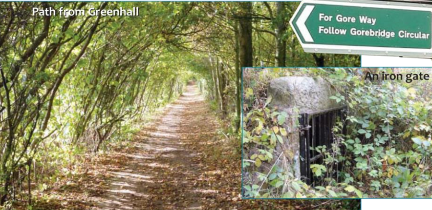
Path from Greenhall

The Gorebridge Circular route was instigated by Gorebridge and District Environmental Group (GADEG). You will be walking on paths through fields and woodland, seeing some impressive views of Midlothian. There are some hills on the way and stout boots are essential, especially if it's been wet. There are often cows in the fields. The route is signed with Gorebridge Circular Walk signs and little green arrows. There are several points of interest along the route including Aldersyde house, the former home of author Annie S. Swan at Robertsons Bank.