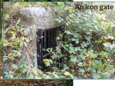
An iron gate